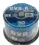
DVD + R