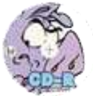
CD + R