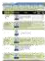
Online Storage Site