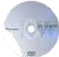
DVD + RW