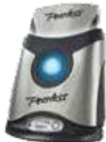
Removable Hard - Drive