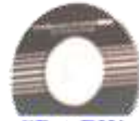
CD + RW