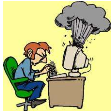
Image files that have been corrupted by a virus or as a result of disc damage may open but will not look the same as an uncorrupted original file. Keeping files stored in multiple locations is an important safety net, should something like this happen.

Most importantly, image files should not be copied to media and left for years unattended or unchecked, because of the potential for data corruption or media obsolescence. As computer and digital photography technologies change, the older storage media types and file formats may fall out of common usage. The files will then be difficult or impossible to retrieve. Avoiding obsolescence may require moving files from one type of storage medium to another, and possibly even resaving files using new file types and file type extensions (e.g. *.jpg or *.tif). Files stored on digital media should also be checked occasionally to verify that the storage medium itself has remained stable and the files can still be opened.